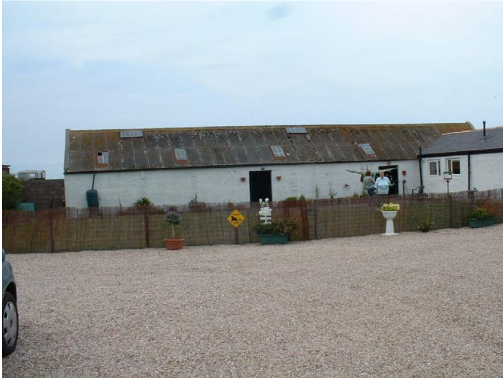
Loanhead Cottage Steading